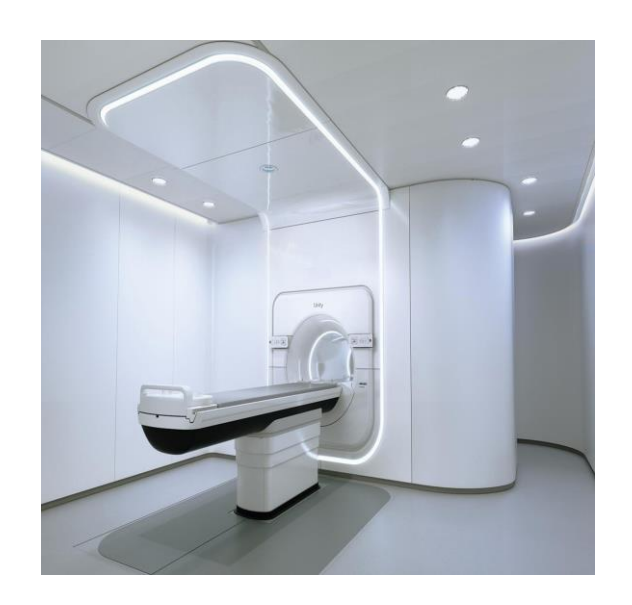
Digitalisation | Procurement of an MR Linac € 9.4million