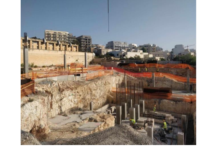
Blood Bank | Establishment of a Blood, Tissue and Cell Centre