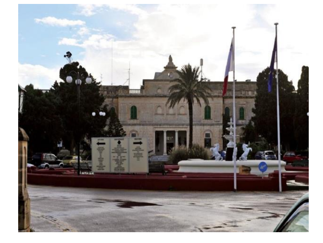
Mount Carmel Hospital | Investment in Renovation & Deep Retrofitting